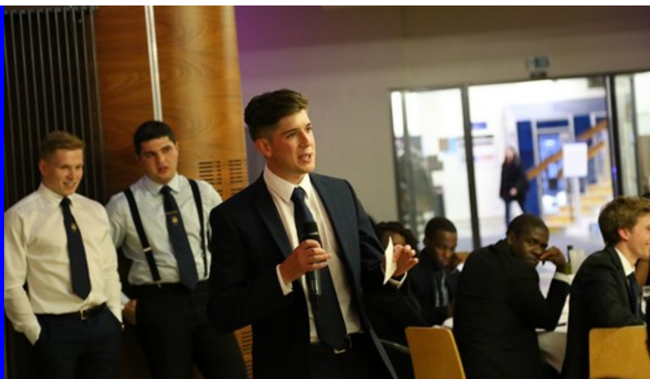
"He seems like a bit of a nob" - Anonymous Fresher