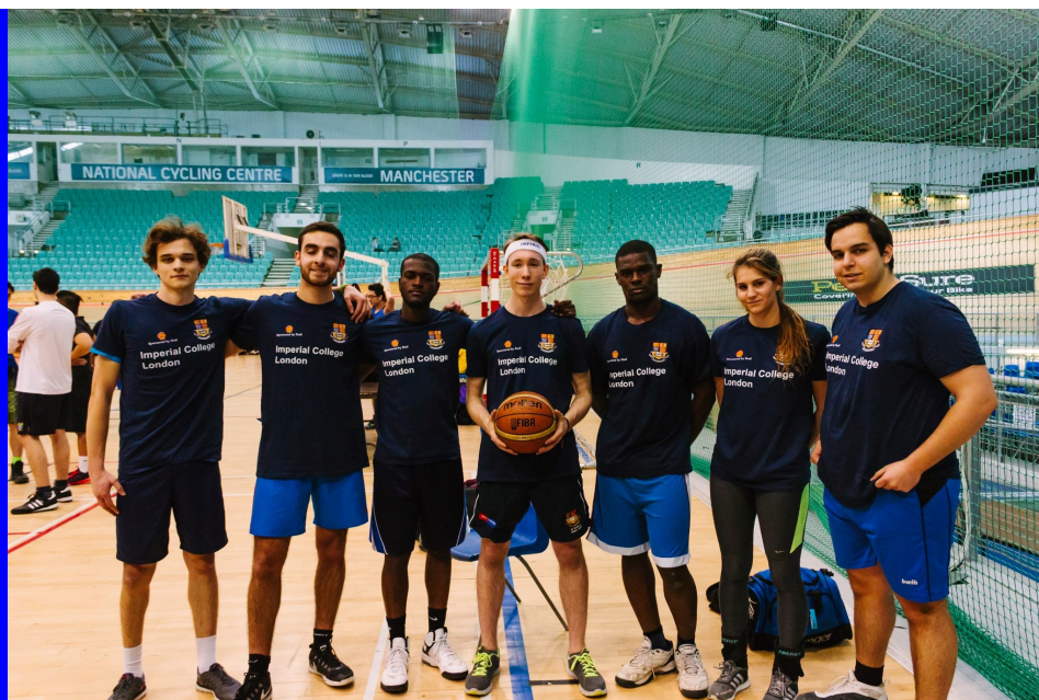
The elite ChemEngSoc basketball team, attaining 3rd place at Frank Morton 2016.

You don't have to be any good or have any experience at all to participate in any of the teams, you just have to be ready to have a good time.