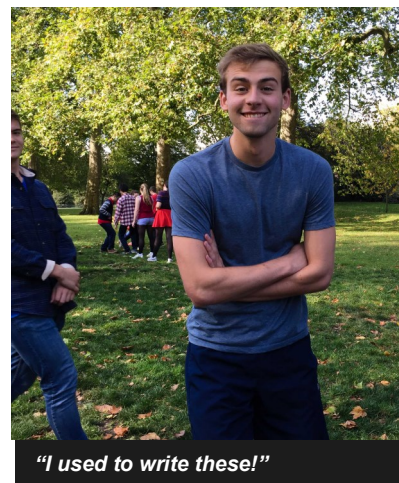
"I used to write these!"