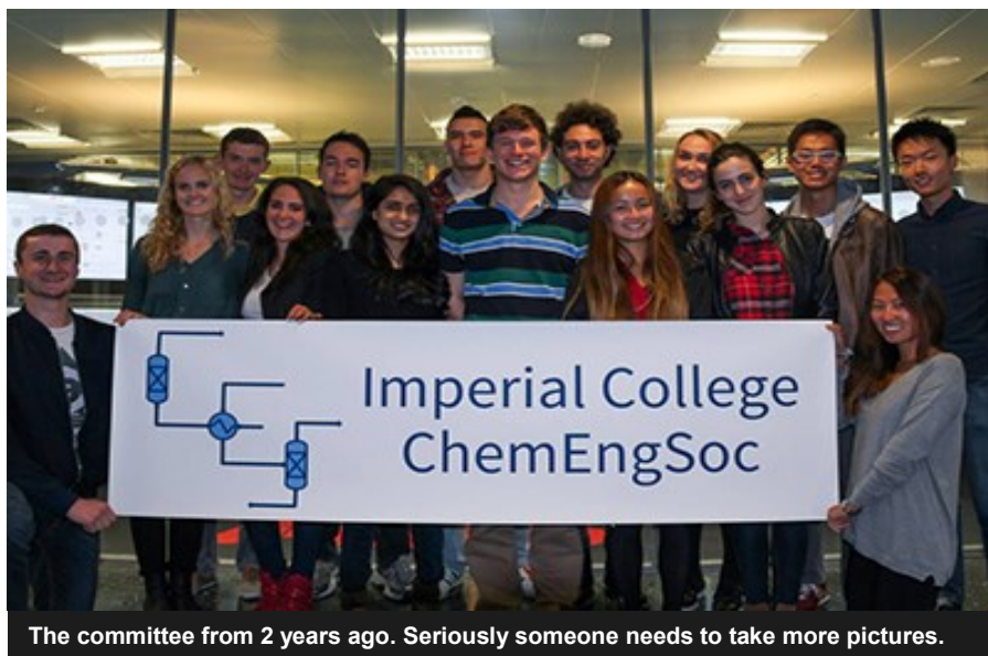
The committee from 2 years ago. Seriously someone needs to take more pictures.